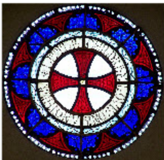
Original 1877 stained glass: "Little Children Love One Another"