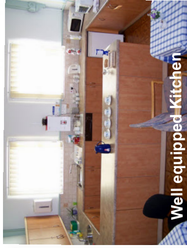
Well equipped Kitchen