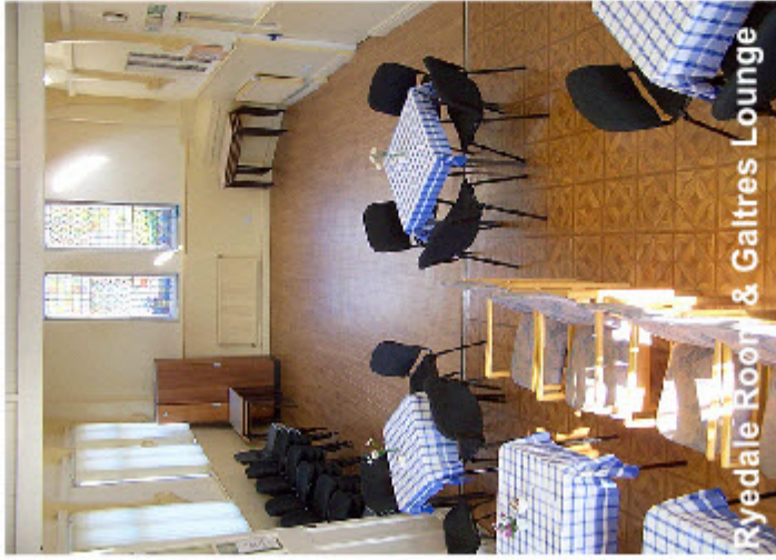
Ryedale Room & Galtres Lounge